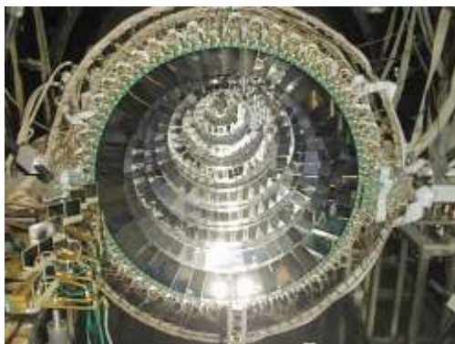
Si-CsI(Tl) CHIMERA detector LNS INFN Catania (It)